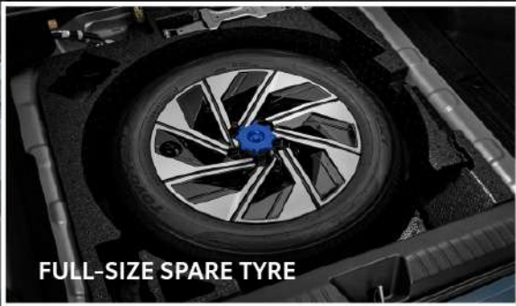
FULL-SIZE SPARE TYRE