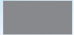
GRANDEUR GREY (WBF)