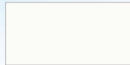
PEARL ARCTIC WHITE (ZHJ)