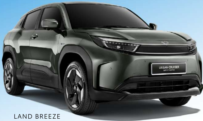
LAND BREEZE GREEN (WA1)