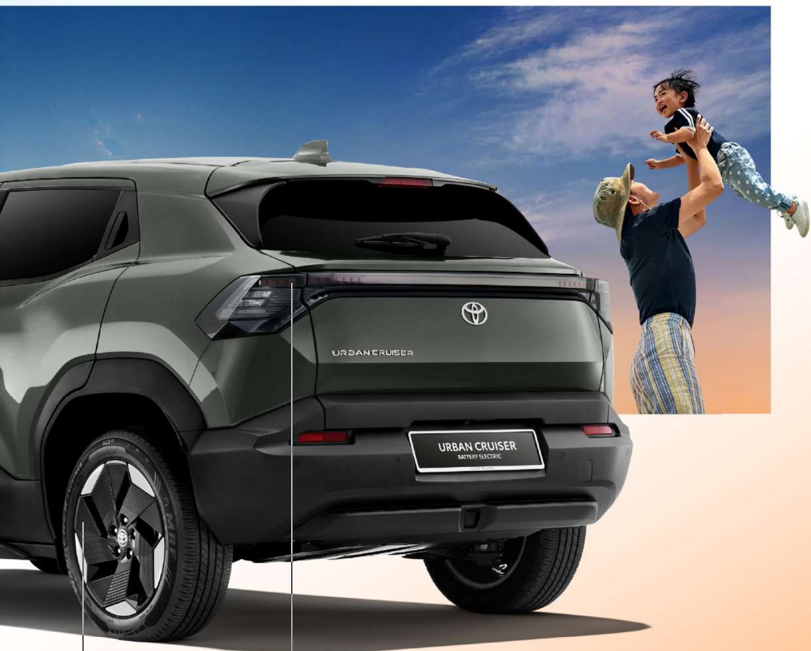
18" Aluminium Wheels

Seamlessly blending form and function, it delivers bright, clear illumination for safe and confident drives.